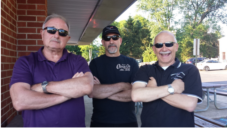
June, 2016 - Jersey Freeze