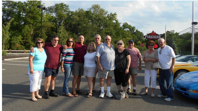
June, 2016 - Fireside Grill