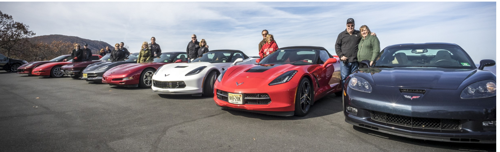
November, 2017 - Shenandoah Valley