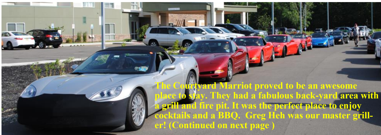
The Courtyard Marriott proved to be an awesome place to stay. They had a fabulous back-yard area with a grill and fire pit. It was the perfect place to enjoy cocktails and a BBQ. Greg Heh was our master grill-er! (Continued on next page )