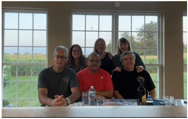
Enjoying some fun time before the Caravan.