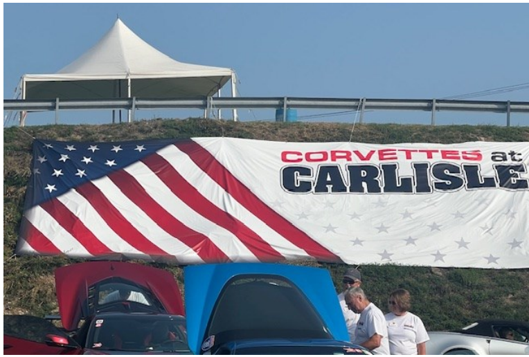
Corvettes at Carlisle